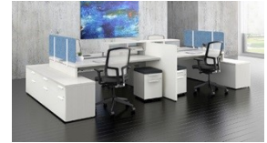
C.I.T.É. Furniture System