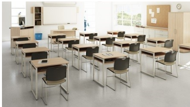
Think Smart Educational Furniture