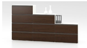
Laminate Lateral Files