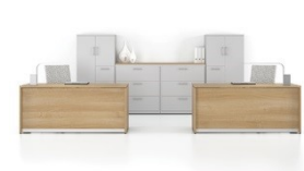
Metal Lateral Files & Storage