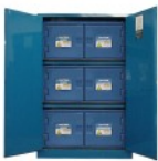
C145 w PE3045