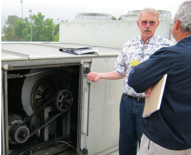
Site visit at a California MARFORRES facility.

Among the challenges this contract presented were an accelerated schedule, multiple facilities, and limited available historical documentation.