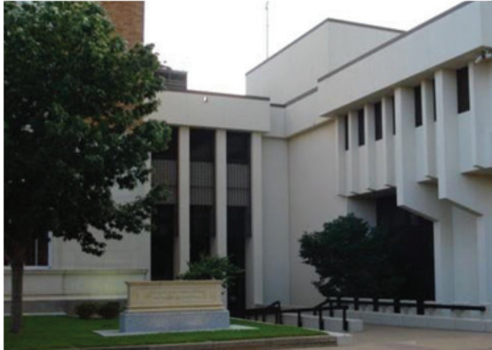
William M. Steger Federal Building & District Court, Tyler, Texas