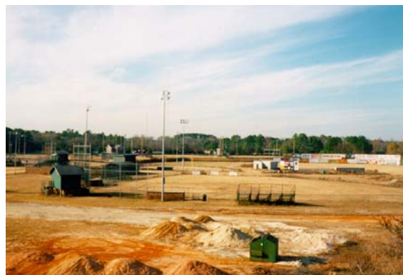
Figure 6: The Augusta-Richmond County feasibility study consisted of a risk assessment that considered a risk-based cleanup approach.

Gannett Fleming conducted the Phase I and II ESAs and prepared a feasibility study that presented the magnitude of site contamination at this abandoned metal scrap yard and options for future site use along with estimated costs to clean up the property. The feasibility study consisted of a risk assessment that considered a risk-based cleanup approach. A site-specific Quality Assurance Project Plan, Sampling and Analysis Plan, and Health and Safety Plan were completed to meet U.S. EPA Region 4 standards.