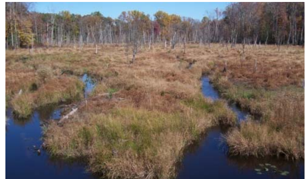
Figure 2: The U.S. 301 Waldorf Area Transportation Improvement Project was the recipient of a 2009 Federal Highway Administration (FHWA) Exemplary Ecosystem Initiative Award.

The community of Waldorf, Maryland is facing enormous growth pressure and substantial travel demands along the U.S. 301 corridor southeast of Washington D.C. This 13-mile corridor area lies