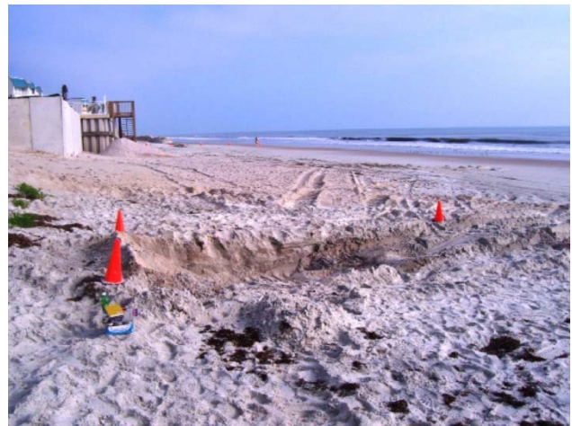
Figure 6: Gannett Fleming initiated field response activities, which included a soil excavation and field screening, after a diesel fuel/water mix splashed from an aboveground storage vessel during its relocation.

firm's personnel, and the results were obtained using an organic vapor analyzer (OVA) equipped with a flame ionization detector. Excavation continued until the scent of petroleum hydrocarbon was undetected.