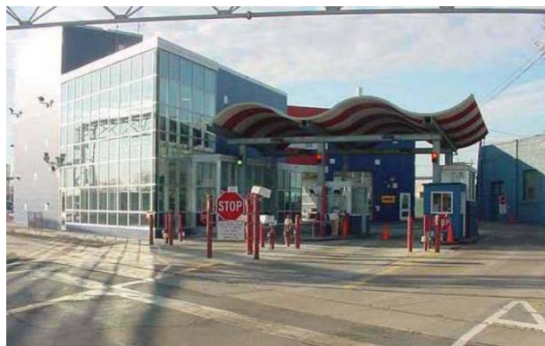
Figure 1: The selected alternative consists of demolishing the existing facilities and constructing a new state-of-the-art LPOE on a 15-acre site, southeast of the existing site.