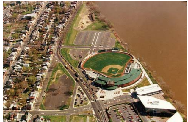
Figure 8: The New Jersey Route 29 project entailed archaeological data recovery and monitoring of 15 historic and prehistoric resources.

This project entailed archaeological data recovery and monitoring of 15 historic and prehistoric resources. Six prehistoric site areas and an 18th- and early 19th-century site containing two house foundations underwent full data recovery in a field effort that spanned 14 months. The project included a public outreach program of school tours, an open house, and the participation of two Boy Scouts earning merit badges in archaeology. A series of non-technical reports were developed for distribution to the surrounding community and interested individuals based on the results of this project and other work conducted in the vicinity. The proposed project was on an accelerated schedule that required simultaneous excavation and construction monitoring. The project increased the knowledge and understanding of the prehistoric