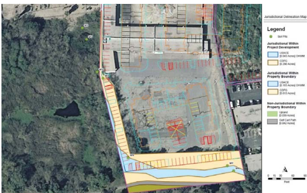
Figure 7: Our firm conducted the initial Phase I ESA to identify REC, or potential environmental concerns associated with the historical use of the properties.

To assist the developer, our firm conducted the initial Phase I ESA to identify recognized environmental conditions (REC), or potential environmental concerns associated with the historical use of the properties. Our firm performed evaluations of soil and soil vapor, including a methane evaluation, and performed a groundwater investigation to evaluate the RECs and environmental concerns identified.