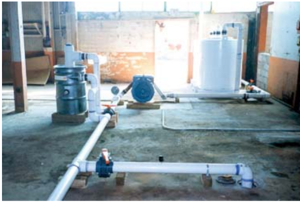
Figure 4: In situ AS is often used in conjunction with vacuum extraction systems to remove the stripped contaminants and has broad appeal due to its simplicity and low costs.

contaminants and has broad appeal due to its simplicity and low costs. The concept of the process has attracted the attention of many and has the potential of being perceived as the “cure-all” for remediating all the sites with dissolved VOCs in groundwater. The difficulties encountered in modeling the multi-phase AS process have caused this technology to be dependent on empirical information for the engineering design of these systems. The controversy as to whether the injected air travels in the form of bubbles or as discrete air channels has added to the confusion in designing these systems. It is just as important to know “what not to do” as it is to know “what to do” when designing this technology.