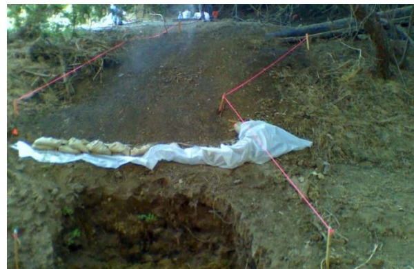
Figure 8: Due to concern over slope stability and further impacts to the stream and native vegetation, the U.S. EPA requested that the remediation be conducted using bioremediation, in lieu of excavation and off-site disposal, and recommended a mix of nitrate and phosphate.

Within six months of admix application, hydrocarbon levels in the soil were measured generally below 1,000 mg/kg, with the exception of two small recalcitrant areas, which were manually excavated. Following the verification sampling, our firm prepared and submitted a closure report to the U.S. EPA. Our firm completed the remediation on time and on budget, which allowed for the transfer of this site to another Vintage asset, as scheduled. The U.S. EPA issued site closure in May 2010.