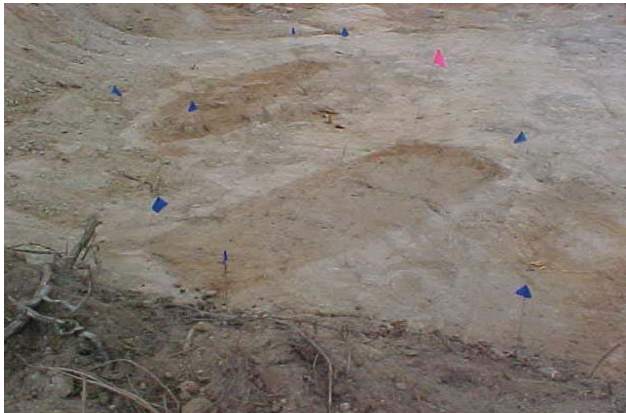
Figure 9: Gannett Fleming conducted an investigation, recovery, and reburial of an unmarked cemetery that was to be impacted by the expansion of a water treatment plant.