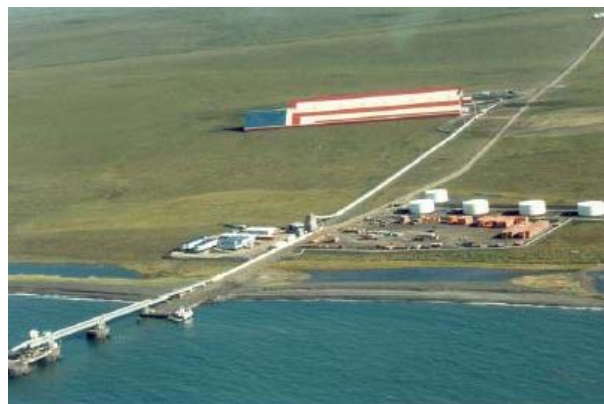
Figure 5: Gannett Fleming prepared a cumulative-effect analysis for the DeLong Mountain Terminal Navigation Improvements near the village of Kivalina along the Chukchi Sea in northwest Alaska.

and air quality and the cultural and social characteristics of the area. Biological considerations included a study of the range and life-history qualities of more than 30 species of marine mammals, marine fish, marine invertebrates, marine vegetation, anadromous fish, freshwater fish, terrestrial mammals, songbirds, and raptors. Cultural and social considerations involved the analysis of potential collective effects on historic and archaeological resources, Cape Krusenstern National Monument, and subsistence practices associated with native Iñupiat people and the overall study area community. Of greatest interest were potential impacts on beluga whales, bearded seal, caribou, and various marine, anadromous, and freshwater fish species, as cumulative effects on these species were identified as potentially affecting both the biological characteristics of the individual species and their contribution to the subsistence culture and economy of the area.