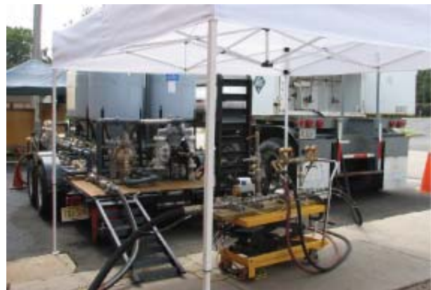
Figure 5: Hydraulic and pneumatic fracturing technologies are now being used for the in situ treatment of contaminant-impacted sediments.

Hydraulic fracturing employs water or other incompressible fluids to propagate fractures. A low-pressure guar gum and sand mixture is used as a "propping" agent to maintain fractures. Pneumatic fracturing relies on high pressure air (or other compressed gas) flow rates. Propping agents are not used.