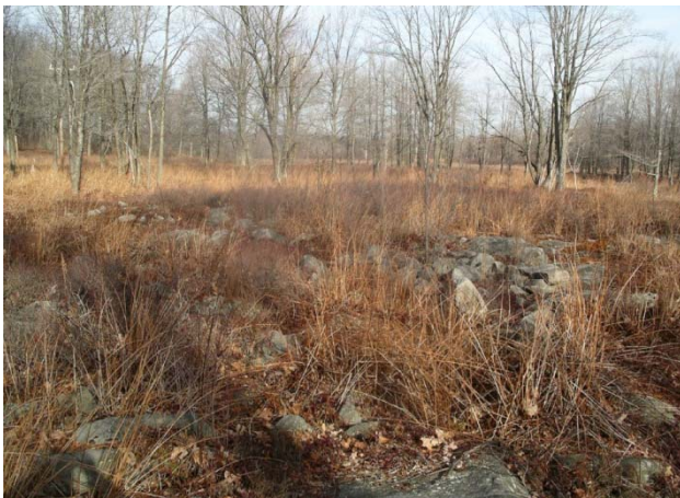
Figure 1: Existing Site