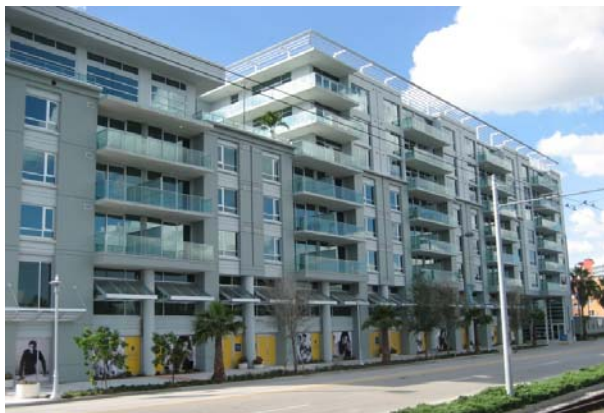
Figure 7: Finished construction at the Place at Channelside

Gannett Fleming was retained by the former owner and developer of the property, Key Developers Group, to assess the environmental impacts to soil and groundwater on the property (approximately 1-acre), to determine the cost of site remediation and design a Remedial Action Plan (RAP) to remediate site impacts and bring the site to closure. The developer had a very short time frame to complete the site assessment and cleanup due to an accelerated construction schedule. We reviewed technical documents from previous clients describing investigations conducted at the site and on adjacent properties. A Phase I ESA and Phase II ESA had been completed for the subject property. The Phase II included a limited soil and groundwater investigation which revealed the presence of chlorinated solvents. A review of historical documents indicated the presence of a rail spur through the property, which would indicate the potential for other environmental impacts. We designed a soil and groundwater investigation to assess the vertical and horizontal extent of chlorinated solvents and potential impacts of petroleum hydrocarbons and arsenic. Due to the location (historical downtown Tampa) and nature of the property, our firm entered the site into the Florida Brownfield Program.