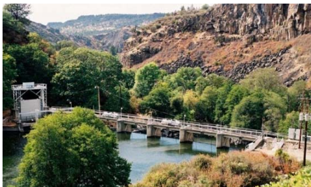
Figure 3: The relicensing required a thorough examination of environmental-related resources to establish a balance between development and non-development values.

Gannett Fleming provided assistance and environmental expertise by analyzing PacifiCorp relicensing documents and related agency and stakeholder comments and recommendations. PacifiCorp operates the 151-megawatt Klamath River hydroelectric project and was required to apply for relicensing with the FERC five years before the license expired. The relicensing required a thorough examination of environmental-related