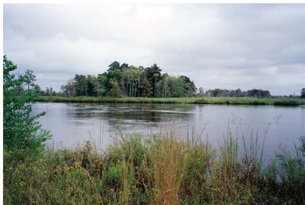
Figure 4: Gannett Fleming wrote the Technical Summary Document (TSD) for the West Chatham County Advance Identification of Wetlands.

pressures. The purpose of the ADID project was to develop a GIS-based model which could determine those existing wetlands best suited for protection, development, and restoration. The Chatham County-Savannah Metropolitan Planning Commission will use the results for planning future growth options. The U.S. EPA, USFWS, and USDA, Natural Resources Conservation Service (NRCS) collected data and literature for the existing conditions in the project area, which covered approximately 45,000 acres in western Chatham County and our firm compiled the preliminary information into the TSD format. The results indicated that many of the existing “pine flatwoods,” which are used for silvicultural operations, are considered jurisdictional wetlands, and subject to protection under Section 404 of the Clean Water Act.