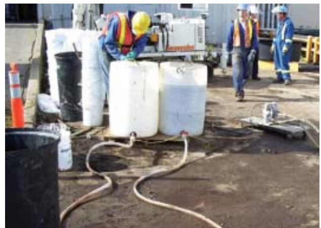
Figure 2: A typical SVE system couples vapor extraction wells with blowers or vacuum pumps to remove vapors from the vadose zone, thus reducing residual levels of soil contaminants.

Gannett Fleming has employed the SVE technology at many different sites to provide remediation of petroleum hydrocarbons, polycyclic aromatic hydrocarbons (PAHs), organic compounds, and hydrogen sulfide in the subsurface media. We have performed numerous investigations concerning the evaluation, testing, and installation of pilot and full-scale SVE systems.