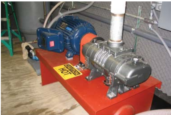
Figure 3: VER (also known as “bio-slurping”) is the application of a vacuum, or negative pressure, to a well and formation in order to enhance the liquid yield of that well by increasing the total net drawdown.

The use of VER systems on environmental remediation projects involves a modification to the approach used in classic dewatering systems. VER has been used as a standard approach toward dewatering and stabilizing low permeability aquifers, increasing the speed of dewatering more permeable aquifers, and enhancing oil recovery.