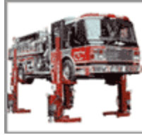
Mobile Column Lifts