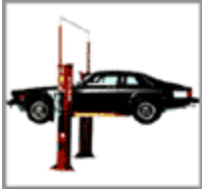
Two Post Lifts