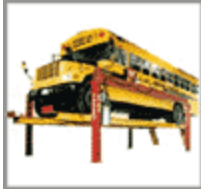
Four Post Lifts